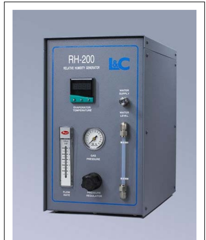
RH-200 Bench-Top Generator with footprint 8" wide by 14" deep.